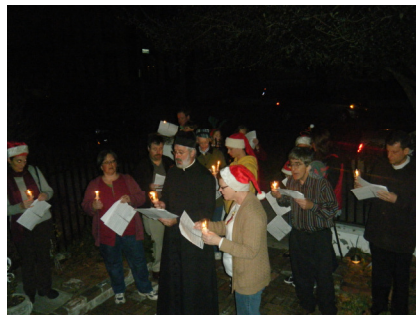
Christmas Caroling in Cannonbough on December 14th.